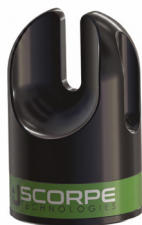
Chain Head 0,7 kg 7,6x7,6x12 cm