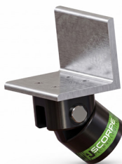
L Head 1,8 kg 15x10x20 cm