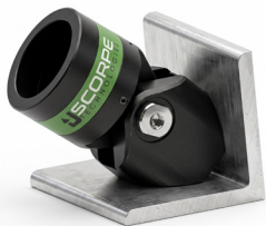
L Base 2 kg 15x13x10 cm