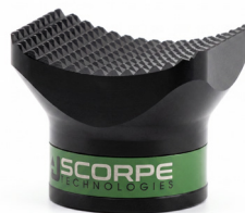
Concave Head 0,8 kg 12x8x8 cm