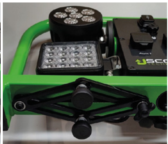
Folded position for tripod use or storage