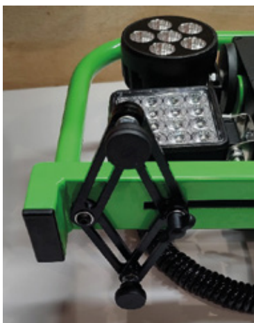
Deployed position for enhanced stability